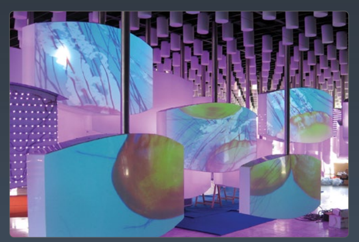
SIEMENS MEDICAL - fischerandfriends

An optional HD Mpeg Encoder is also available for direct media conversion.